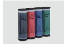
RISO INK FII Type Color (1000 ml)

The RISO iQuality mark indicates a RISO product compatible with the RISO iQuality System.