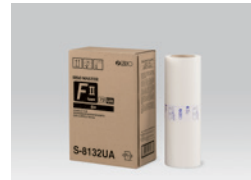
RISO MASTER FII Type (B4: 250 sheets)