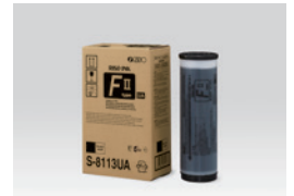
RISO INK FII Type Black (1000 ml)