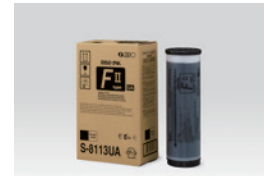
RISO INK FII Type Black (1000 ml)