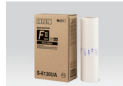
RISO MASTER FII Type (A3: 220 sheets)